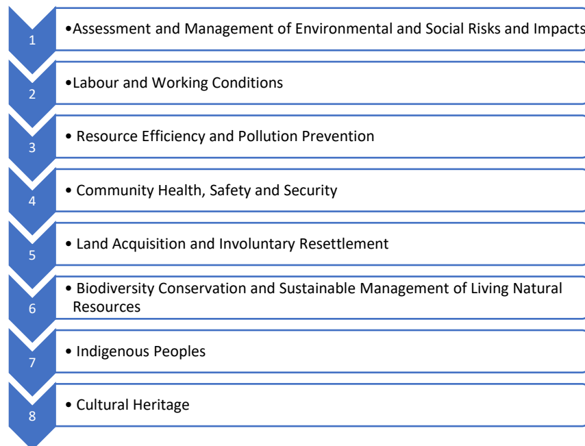
Figure 3. Social and Environmental Safeguards of the Green Climate Fund

Therefore, once potential risks and impacts that may be triggered by the Project implementation in communities and environment have been identified, a correlation of the activities with the environmental and social safeguards of the Green Climate Fund is made, in order to support the successful implementation of proposed by contributing to the generation of guidelines so that no involuntary damage to people or ecosystems is generated (WRI, 2015). The environmental and social safeguards of the Green Climate Fund establish a general standard (ESS1) for the evaluation and management of environmental and social risks and impacts, and seven remaining standards that cover specific themes (ESS 2-8); ESS1 covers the elements that must be implemented to support the remaining seven standards implementation (GCF, 2019). The following figure shows each Standard: